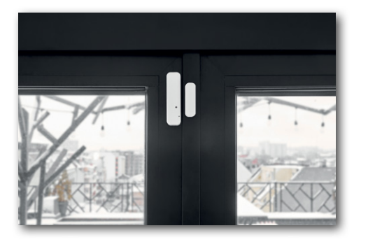
Door/window is opened